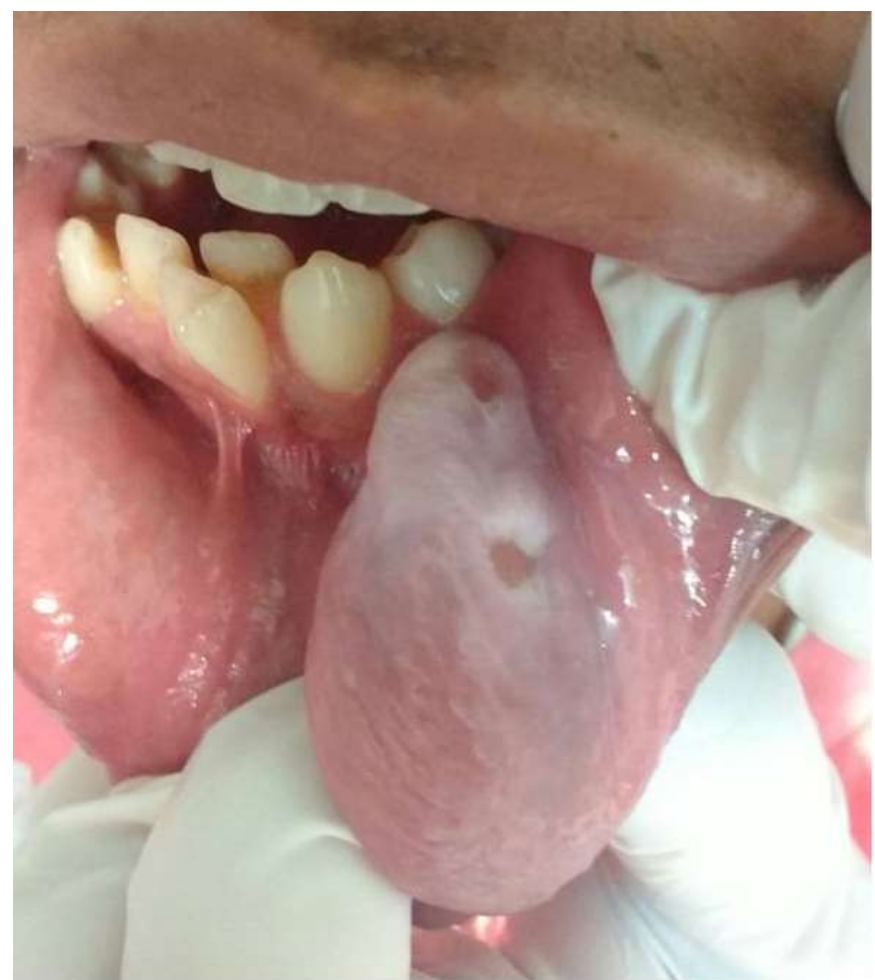
Figure 2. Presence scoring bites in an attempt to occlusal of the patient, presence of teeth crowding

Fibroma by being reactive and everyday injuries in daily life of Stomatological, depending on their characteristics, can be diagnosed as other diseases from hyperplasia or papillomas and hemangiomas as described by Regezi et al. 5 , which sets up mainly with what was exposed, the surgical removal treatment of the injury associated imperatively removal of the causative agent, thus avoiding the remission of the disease.