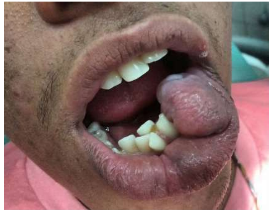
Figure 1. Extensive lesions in the oral mucosa, preventing power of the patient, occlusion and mouth closure

the exaggerated size of the fibroma concerned this fact is of importance injury herein because not 1.5 cm reported in the literature but an injury exaggerated dimensions hitherto little knowledge had in the literature 3 .