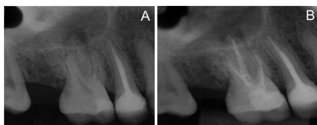
Figure 2: Initial radiographic appearance, where radiographic absence of communication of the restorative material with the pulp chamber is observed. In addition, thickening of the periodontal ligament and radiolucent area associated with the root apex and its intimate relationship with the maxillary sinus floor (A) radiographic treatment after endodontic treatment (B).

solution. The initial exploration of the canals was performed with endodontic files # 15 K (Dentsply Maillefer, Ballaigues, Switzerland) for initial drainage and, in later sessions, the chemical-mechanical preparation of the root canals was finalized with the aid of ProTaper U® files (Dentsply Maillefer, Ballaigues, Switzerland). The channels were filled with F2 gutta-percha cones (Dentsply Maillefer, Ballaigues, Switzerland), using AH Plus Sealer cement (Dentsply, DeTrey, Konstanz, Germany) for adhesion and the hot condensation technique with Gutta-Condensor # 50 (Dentsply, Maillefer) was applied. After filling, a composite-resin restoration was performed, with subsequent occlusion adjustment (Figure 2B). Seven days after the canal was finished, facial edema and painful symptoms were reversed.