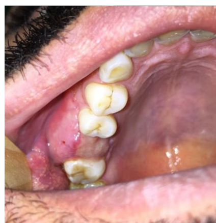
Figure 1: Oroantral fistula at initial clinical examination.

A 35-years-old male patient, melanodermic, presents the Oral and Maxillofacial Surgery and Traumatology Service of the Santa Casa de Misericórdia in Montes Claros, complaining of fluid passing from the oral cavity to the nasal cavity, in addition to halitosis and pain in the region. The patient reported that the communication appeared one week after upper right first molar extraction. Intraoral clinical examination showed the presence of a defect in the alveolar ridge in the attempt to close the fistula. Patient reported not being a smoker and not having any drug disorders or allergies, presented normal pulse, blood pressure and respiratory rate (Figure 1).