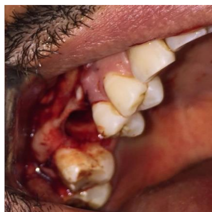
Figure 2: Incision in the surgery field.

After local anesthesia, an incision was made in the region, complemented by a relaxing incision, with bone support so that the granulomatous inflammatory tissue inside the opening was completely excised (Figure 2).