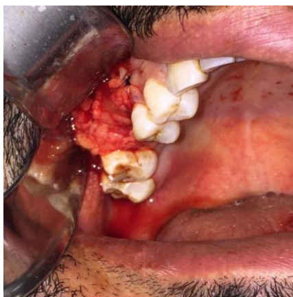
Figure 4: Suture between adipose and gingival tissue.

The mucoperiosteal flap was repositioned in its original position, and the sutures were performed between the adipose body and the oral flap (Figure 4). After adaptation of the adipose body over the bone defect, the suture was performed (Figure 5).