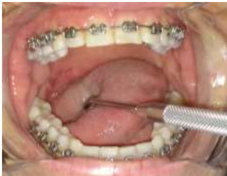
Figure 1: An ulcerated soft palate lesion was observed on the right, with an area of hyperemia around it, approximately 2cm in diameter, irregular edges, with purulent secretion inside and painful to the touch.

During the anamnesis, the patient reported that the symptoms were present for 13 days and, at that time, she even lost 6 kilos. Clinically, an ulcerated soft palate lesion was observed on the right, with an area of hyperemia around it, approximately 2cm in diameter, irregular edges, with purulent secretion inside and painful to the touch (Figure 1). The presence of trismus was also observed. On palpation, presence of hard, mobile and painful lymph nodes in the bilateral submandibular region. The initial diagnosis of an inflammatory lesion in the salivary gland was established.