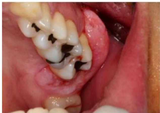
Figure 1. Nodular lesion in the alveolar ridge in the 27 region.

A 42-year-old woman attended our Service of Stomatology complaining of a mass in the gingiva. Physical examination revealed a pedunculated nodular lesion involving the alveolar ridge in the gingival area in the 27 region, measuring approximately 2,5 x 2,0 cm, asymptomatic, resilient to palpation, with two years of evolution, without definite cause (Figure 1).