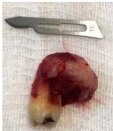
Figure 3. Surgical specimen of the lesion after total excision.

The patient underwent an incisional biopsy, and the initial diagnosis was compatible with chronic inflammatory periodontal disease. Considering the clinical, radiographic and microscopic aspects, the treatment was the excision of the lesion and exodontia of the teeth 27 and 28. The lesion was completely removed and sent for microscopic examination (Figure 3).